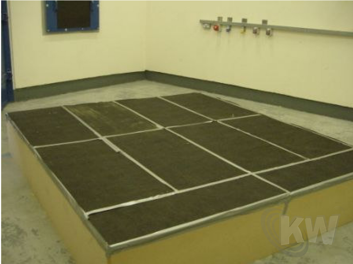
Figure 4.3: Test sample fitted to the Type E mounting.