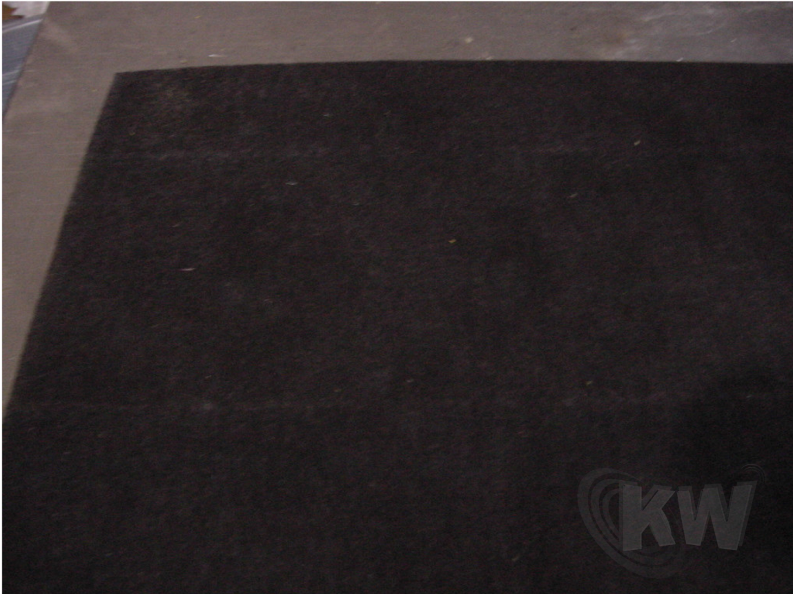
Figure 4.1: Close up of the Cineplextone material